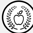
Athena Goddess of Wisdom