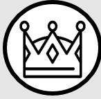
Alexander the Great Established the largest ancient empire