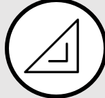
Pythagoras Mathematician famous for proof of right angles in triangles