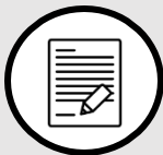
Homer Author famous for writing the Iliad and Odyssey