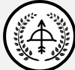
Aphrodite Goddess of Love