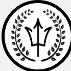
Poseidon God of the Sea