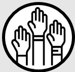
Cleisthenes Known as "The Father of Democracy"