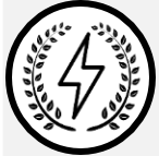
Zeus God of the Sky (King)